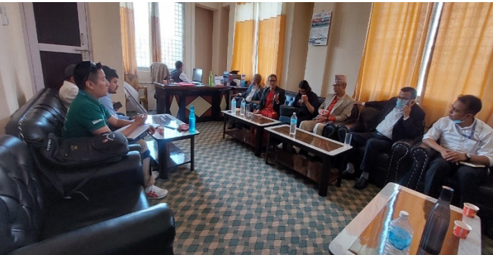
Photo Details: Briefing Hon. Minister of Social Development and Health during a meeting in Tanahun Health Office regarding the activities planned and way forward for dengue response.