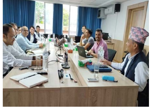
Photo Details: Meeting to draft second five-year plan of Gandaki province