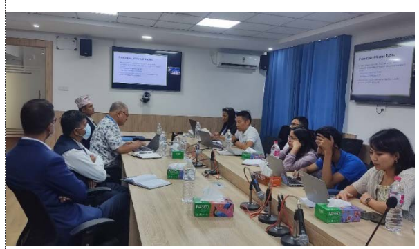
Photo Details: Presentation on rabies management guideline conducted by FMO