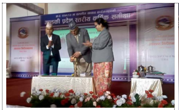
Photo Details: Hon. Chief Minister inaugurating Provincial annual health review meeting