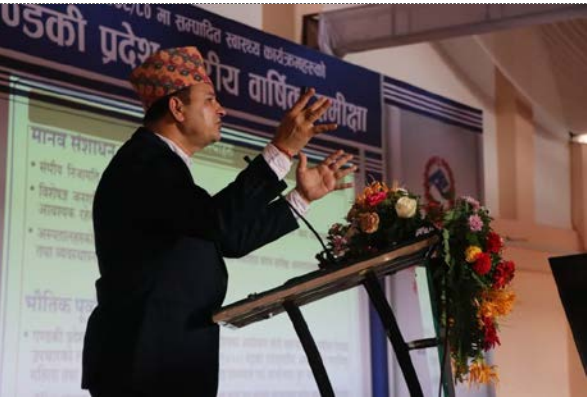
Photo Details: Secretary MoSDH, delivering his remarks in Annual Health review meeting