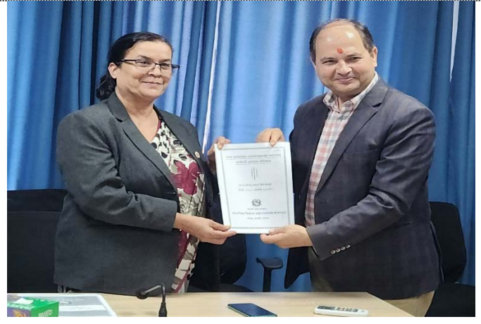
Photo Details: MoSDH secretary handing over Hospital Upgradation report to Hon. Minister